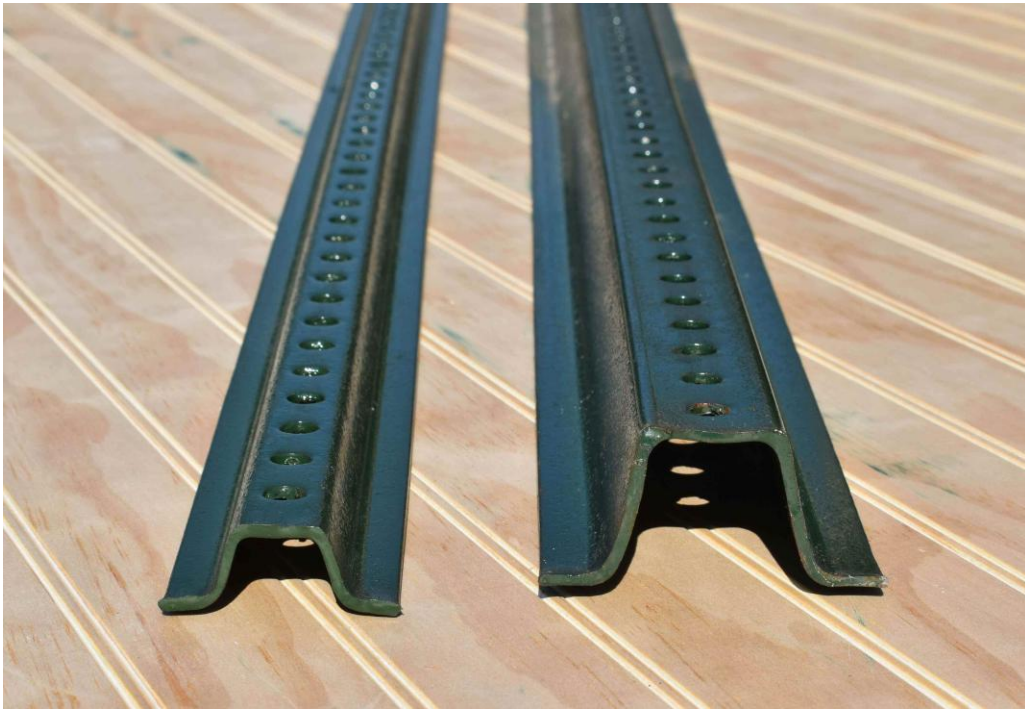
This is the 1.12lb/ft.

larger or more permanent signs between 2 and 9 square feet, the 2 lb/ft and 3 lb/ft posts provide the necessary stability and strength for long-lasting installations.